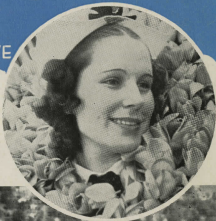
Tulips and pretty girl feature Tulip Festival held each April.