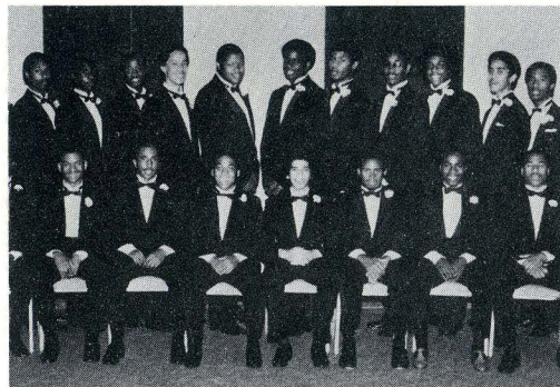
On a Sunday in May, the Achievers are presented and honored by the Community.

may be of use to the Achiever and to his community. The culmination of the Achiever program is the taking of an oath, by each young man, to give life-long service to the community and to share their talents and abilities with others. They are not only Achievers for the six months of their participation in the program, but Achievers for life.