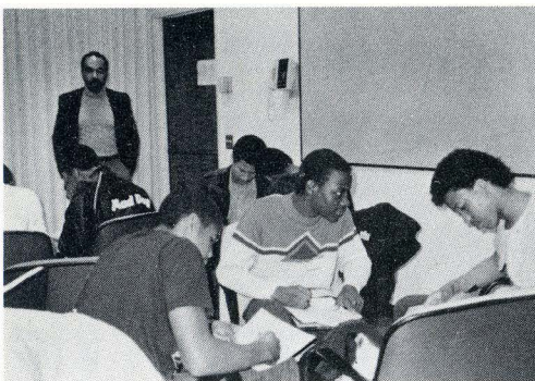
Achievers meet in Leadership Training Workshops.

CPR Training, special social events, and a scholarship campaign. Each Achiever is given a Mentor or Confrere who assists him with personal development and decision making about careers and colleges.